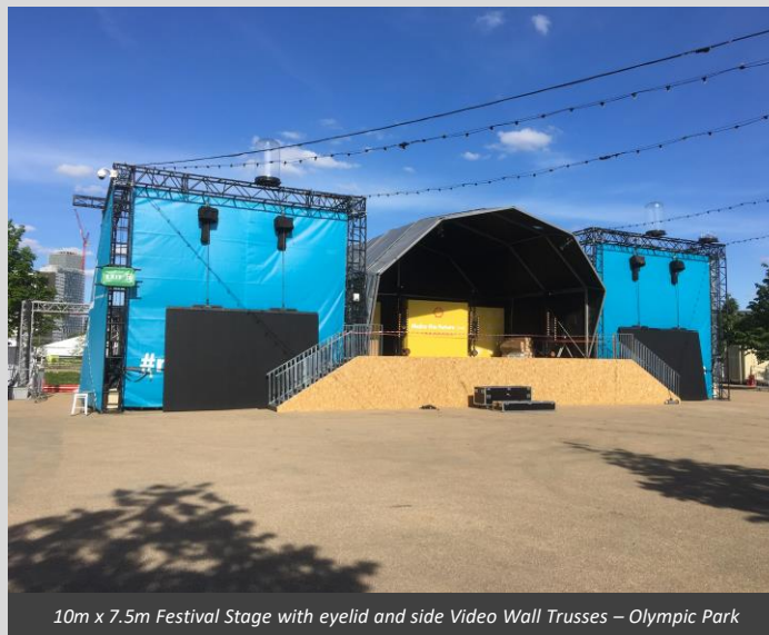
10m x 7.5m Festival Stage with eyelid and side Video Wall Trusses – Olympic Park