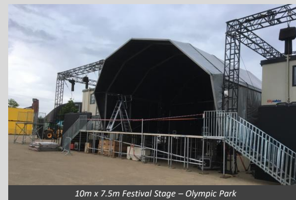
10m x 7.5m Festival Stage – Olympic Park

T: +44 (0)1922 405111 – E: info@stagingservicesltd.co.uk W: stagingservicesltd.co.uk