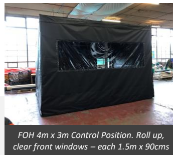
FOH 4m x 3m Control Position. Roll up, clear front windows – each 1.5m x 90cms