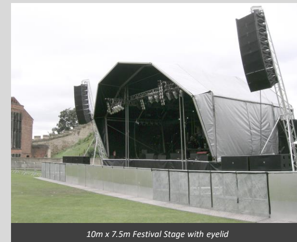
10m x 7.5m Festival Stage with eyelid