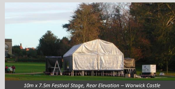
10m x 7.5m Festival Stage, Rear Elevation – Warwick Castle