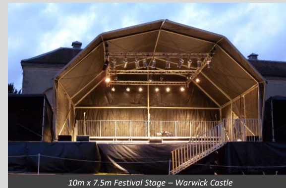
10m x 7.5m Festival Stage – Warwick Castle