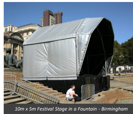
10m x 5m Festival Stage in a Fountain - Birmingham